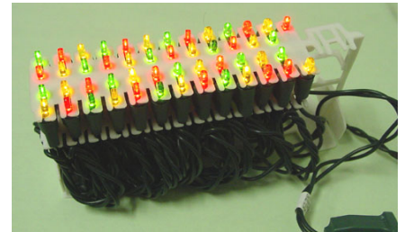
LED holiday lights