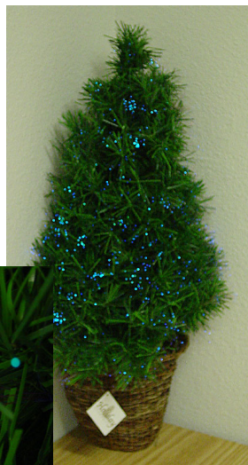
Fiber Optic Tree